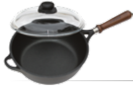
SAUTE PAN ø 20* | 24* | 28* | 32* cm.