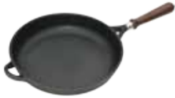
FRYING PAN ø 20* | 24* | 28* | 32* cm.