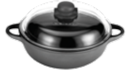
CASSEROLE ø 16 | 20* | 24* | 28* | 32* cm.