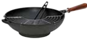
WOK ø 32 cm.